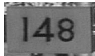
Figure 9022-2 SRP radio code sign

This code ensures that where there are more than one set of SRP in any area, only the correct set will respond.