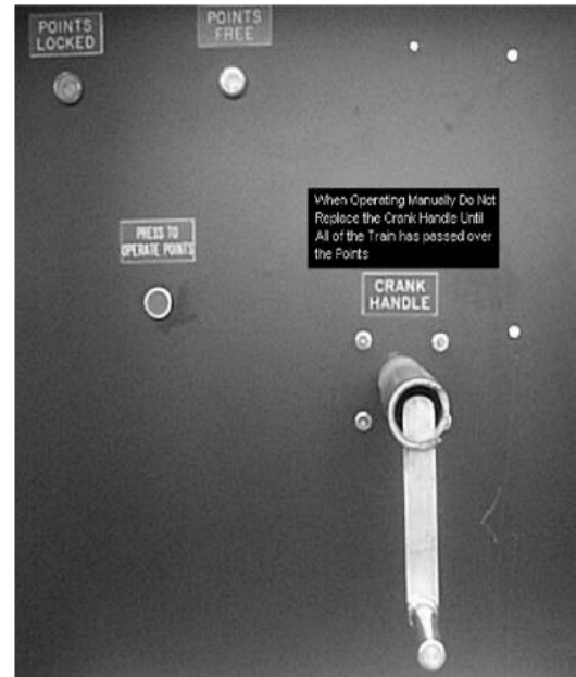
Figure 9022-3 Local control panel/crank handle case

When the push button is operated, the Points Indicator lights will extinguish and the Points will move to reverse. After the Points are set into reverse and become locked and detected, the Points Indicator will illuminate to correspond with the lie of the Points .