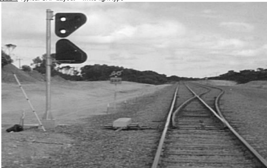
Figure 9022-1 Typical SRP Layout – white light type

The same indication will be displayed on the lower Points Indicator if Rail Traffic is approaching from the Trailing direction.